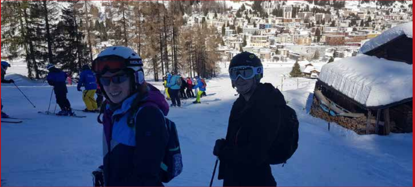
Sixth Form students enjoying time on the slopes during the Davos 2019 ski trip.

Our Sixth Form Leadership team have organised regular open mic nights that help to showcase a variety of talents within Years 12 & 13.